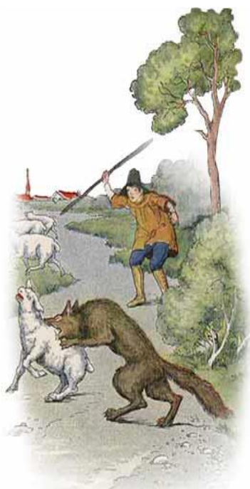
One of Aesop's fables

Once upon a time, there was a young boy. He was a shepherd. He took care of the village sheep. Every day, the boy took the sheep to a green field. The field was near a forest.